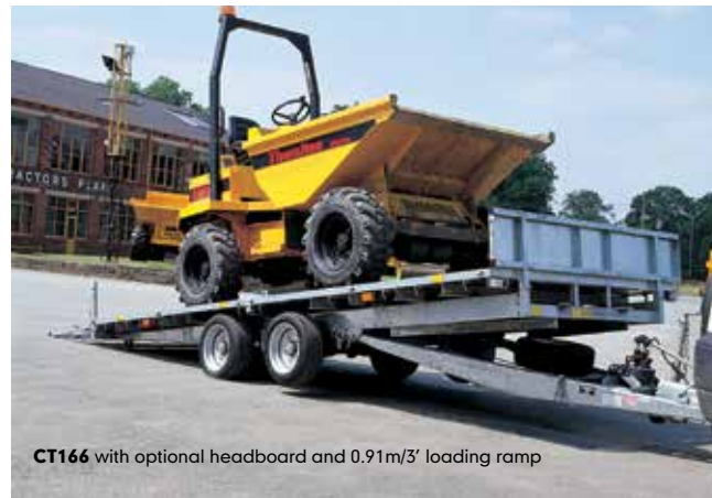
CT166 with optional headboard and 0.91m/3' loading ramp

CT166 with optional 0.91m/3' loading ramp (0.3m/1' loading ramp comes as standard)