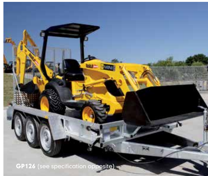
GP126 (see specification opposite)