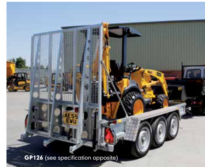
GP126 (see specification opposite)