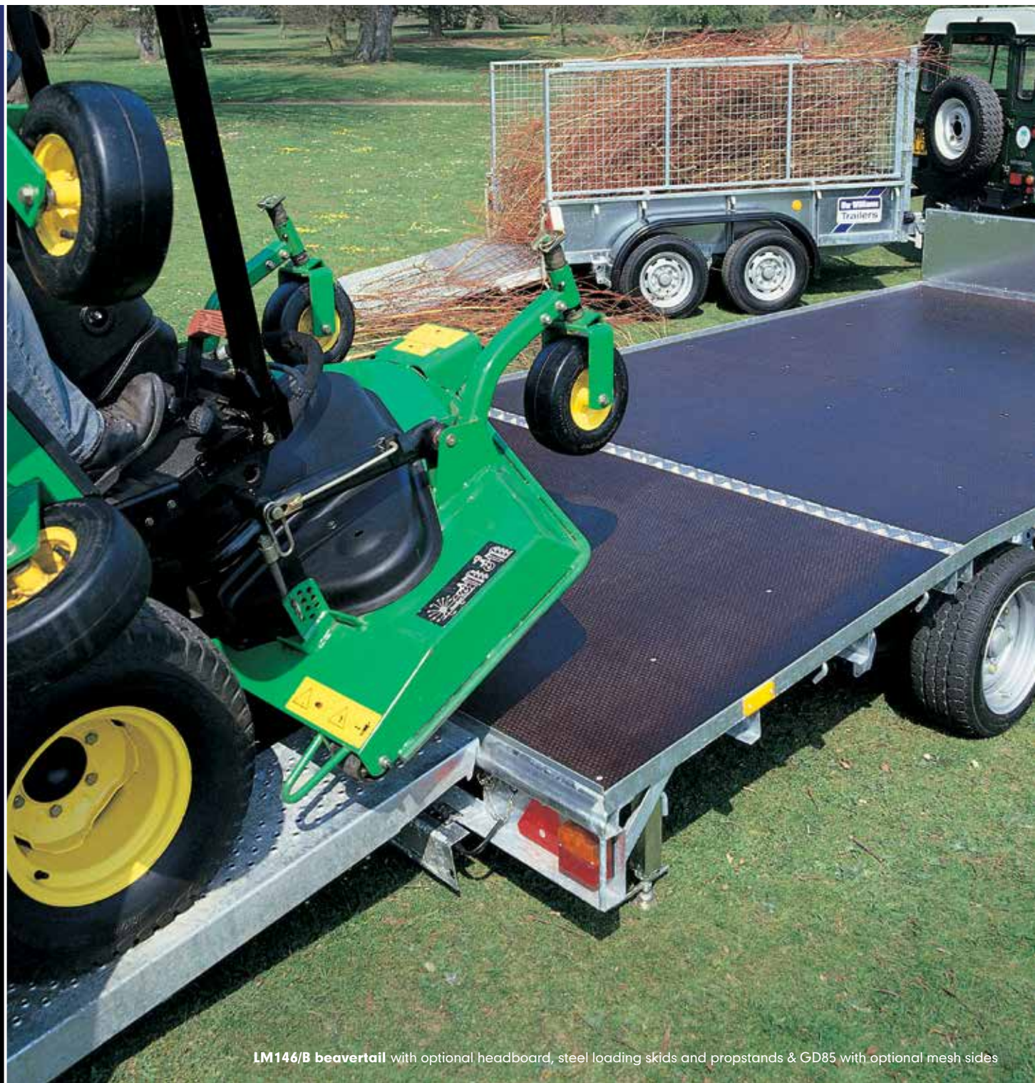
LM146/B beavertail with optional headboard, steel loading skids and propstands & GD85 with optional mesh sides

We are an independent company with one focus: to build the best products on the market. More than 30,000 people choose our trailers each year - but we're not standing still. Our dedicated investment in new technologies and materials ensures that our products continue to exceed the expectations of our customers. We know that quality, strength, value and ease of maintenance are of vital importance to you. That's why we've made them the driving force behind everything we do.