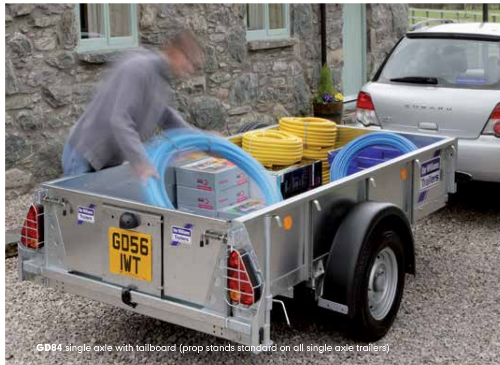
GD84 single axle with tailboard (prop stands standard on all single axle trailers)