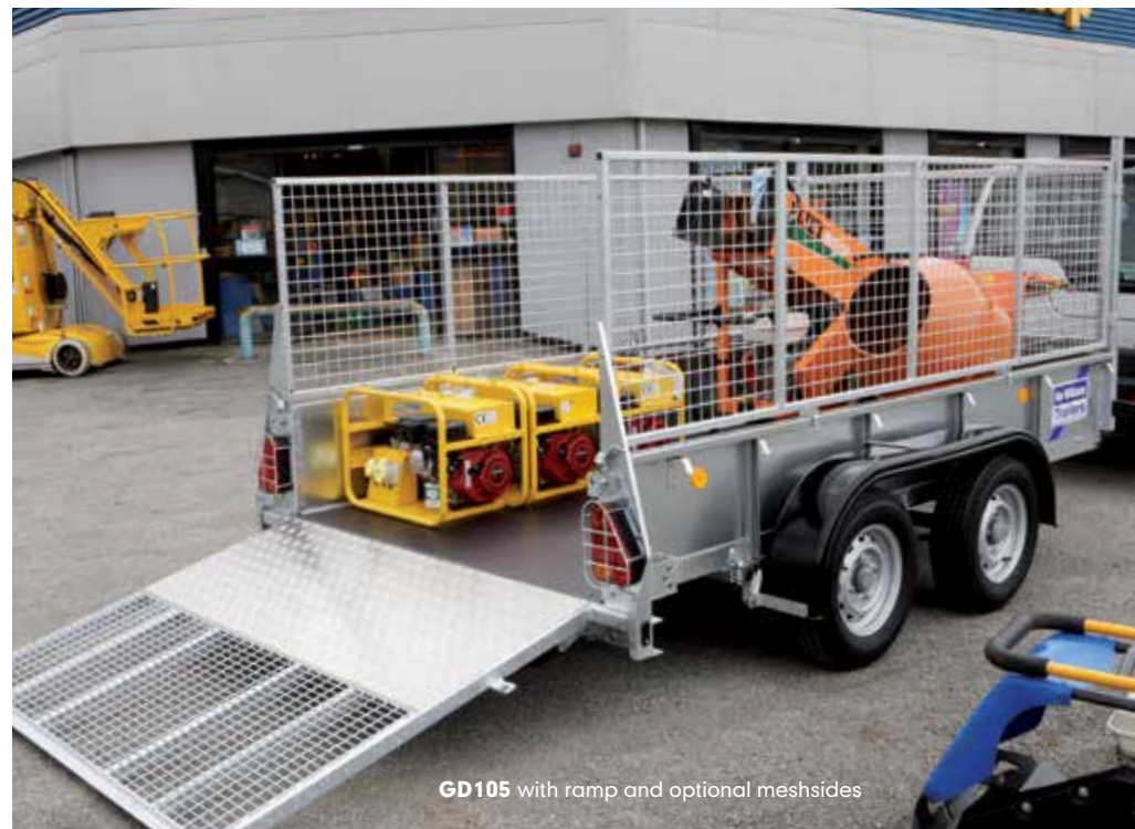
GD105 with ramp and optional meshsides