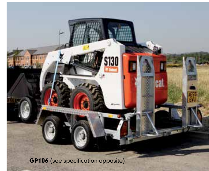
GP106 (see specification opposite)