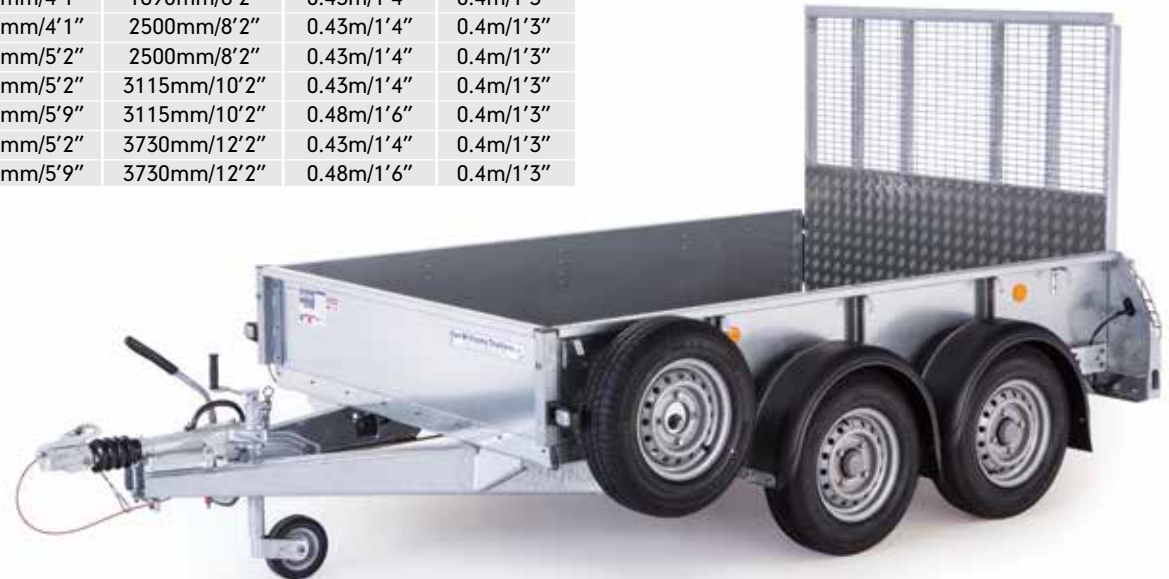
GD105 with ramp and optional meshsides