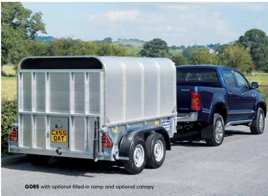
GD85 with optional filled-in ramp and optional canopy