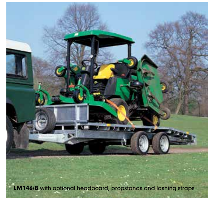
LM146/B with optional headboard, propstands and lashing straps