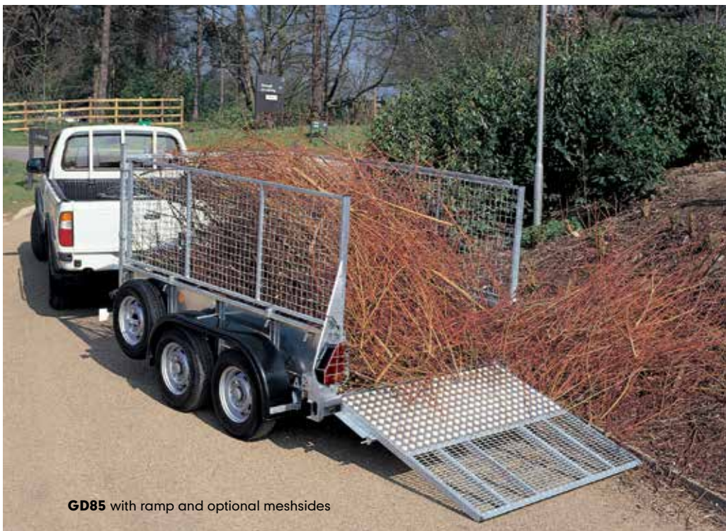
GD85 with ramp and optional meshsides