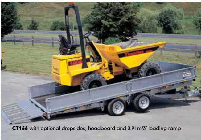
CT166 with optional dropsides, headboard and 0.91m/3' loading ramp