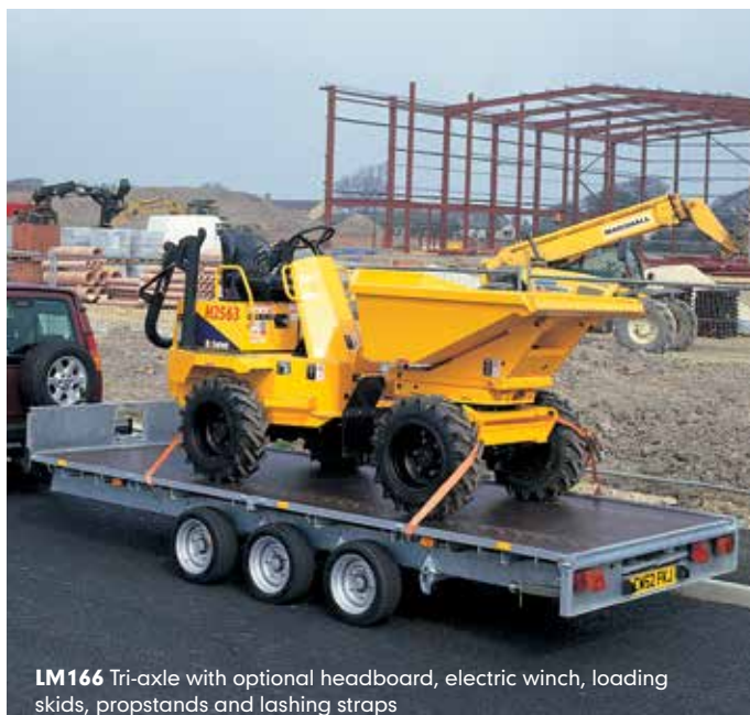
LM166 Tri-axle with optional headboard, electric winch, loading skids, propstands and lashing straps

The maximum gross weight for the LT model is 2000kg, whilst the heavier LM models offer between 2700kg and 3500kg.