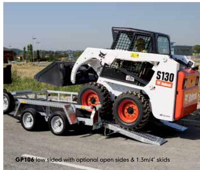
GP106 low sided with optional open sides & 1.3m/4' skids

High sided models come with filled in sides, an optional bucket rest and axles which are more centrally positioned. This option is ideally suited to users who require flexible usage from their trailer; a reliable plant trailer providing higher sides for use as a general duty trailer.