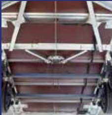
Chassis & Floor

It's the attention to detail of Ifor Williams trailers that makes our products so popular with owners. Just take a look at these standard features.