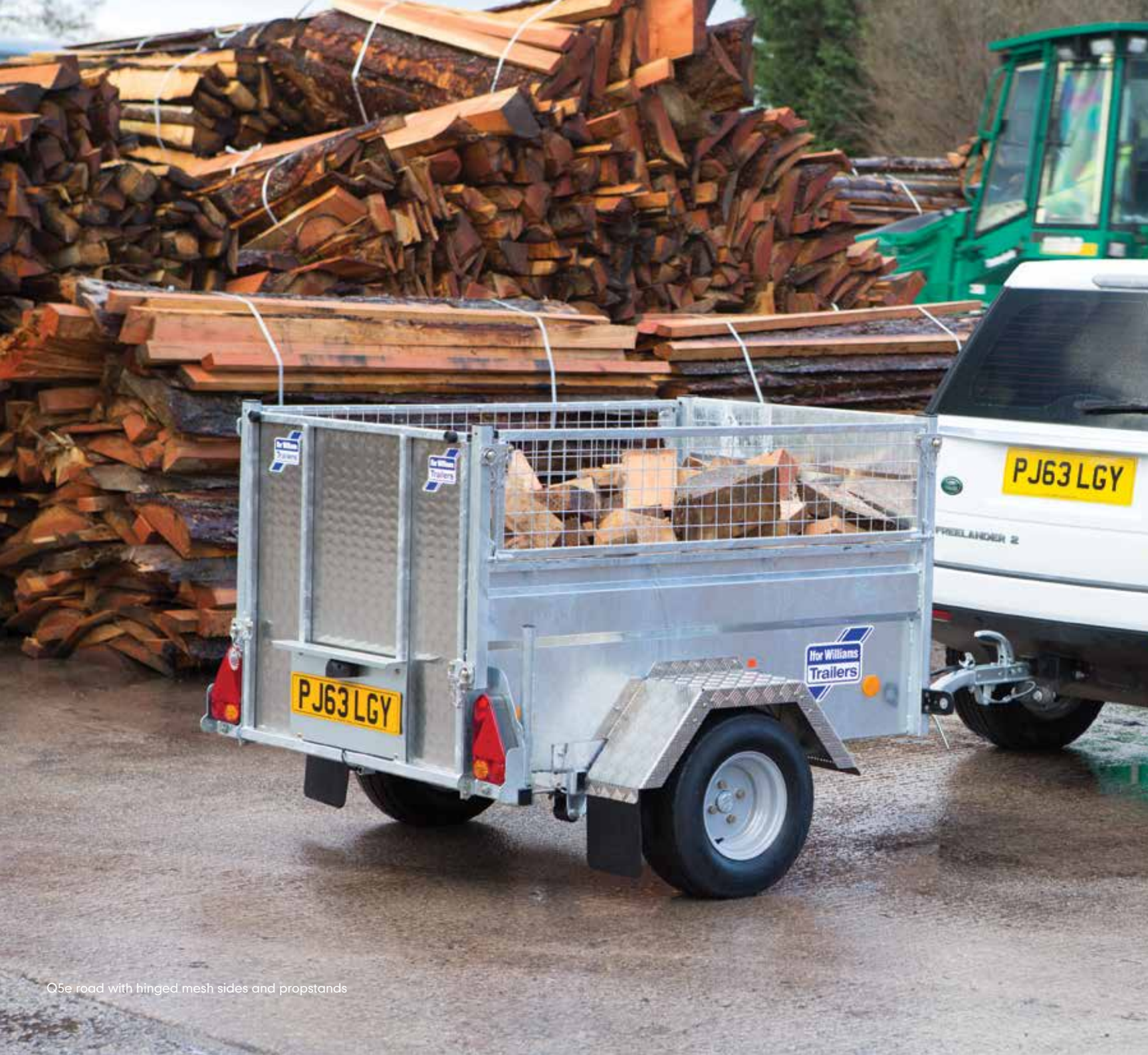
Q5e road with hinged mesh sides and propstands