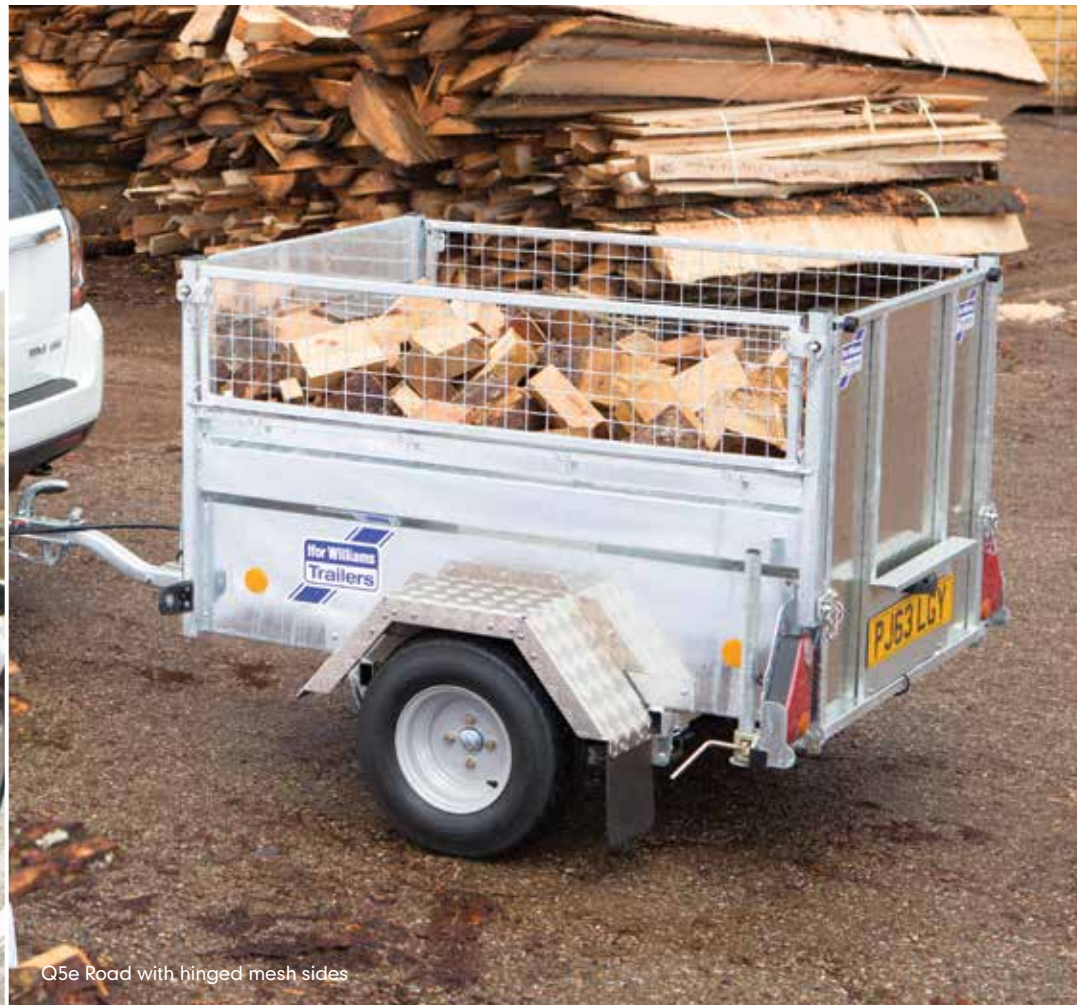
Q5e Road with hinged mesh sides

*Please check towing vehicle manufacturer's handbook for maximum unbraked towing limit.