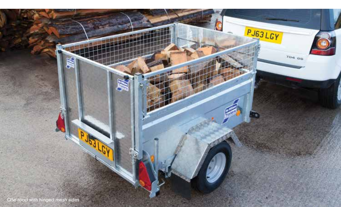
Q5e road with hinged mesh sides