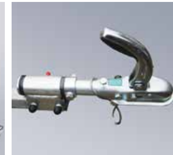
Swivel Hitch option available for off road use only (Not type approved for road use*)