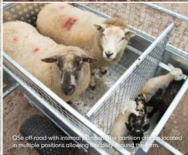
Q5e off-road with internal partition. The partition can be located in multiple positions allowing flexibility around the farm.