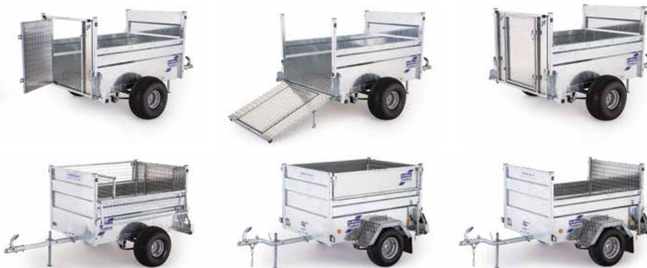
Q5 Q5e off-road and road versions showing different ramp, hinged sides and internal partition options