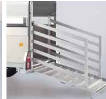
Optional ramp gates available on Q6, 7 and 8