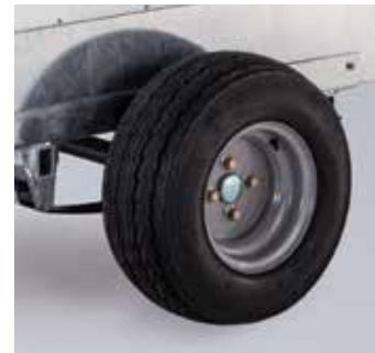
Q5/6/7e off-road flotation tyres (20.5 x 8-10)