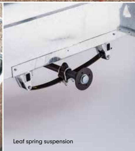
Leaf spring suspension