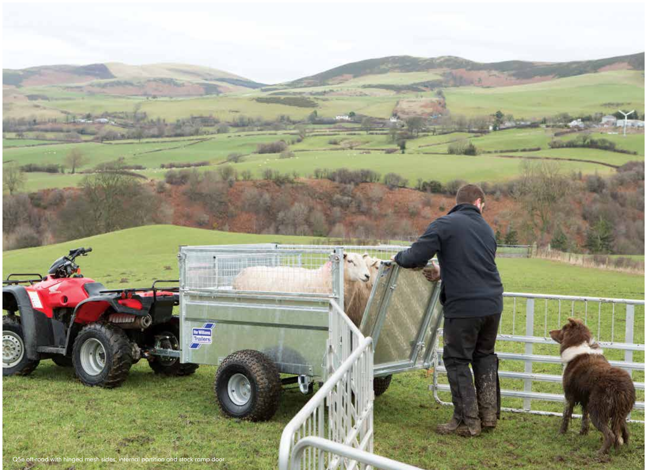
Q5e off-road with hinged mesh sides, internal partition and stock ramp door