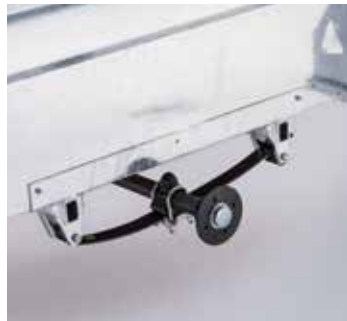
Leaf spring suspension is standard