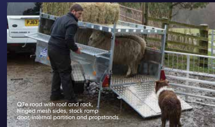
Q7e road with roof and rack, hinged mesh sides, stock ramp door, internal partition and propstands

* The roof and rack has a maximum recommended weight of 50kg and uses two fasteners which are easily removed.