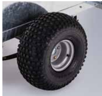
Q5e off-road knobby tyres (22 x 11-8)