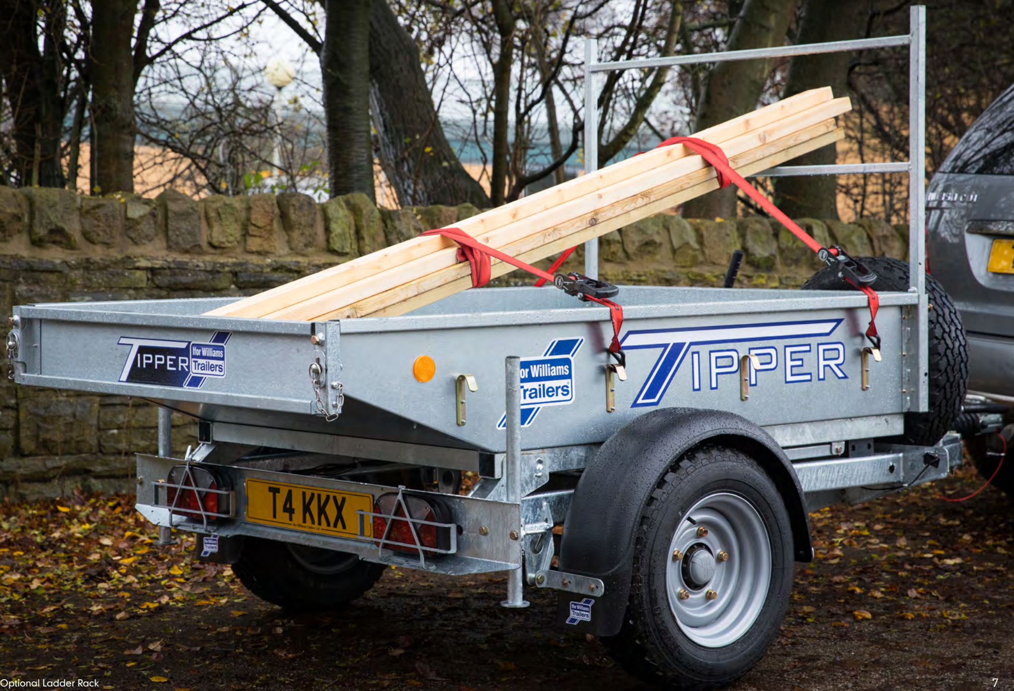
TT2012 With Optional Ladder Rack