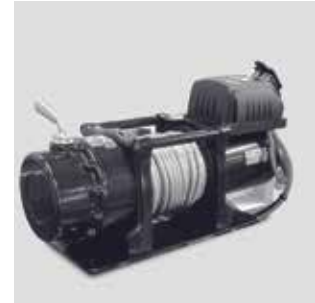
Electric Winch 4500lb (2100kg) Ask your local distributor for details.

Extra high ramps (3' High) - CT166 £197 - CT167 £252. Manual winches not available on CT models.